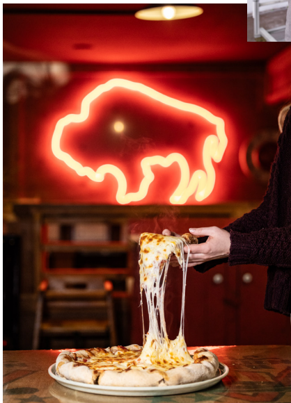
The Great Plains Sauce & Dough Co.