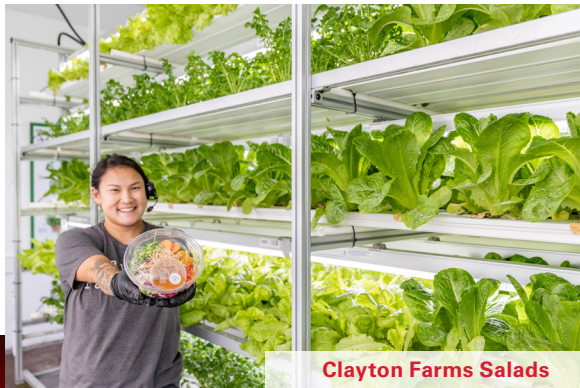
Clayton Farms Salads