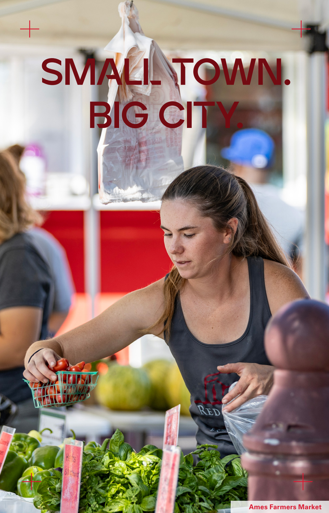
Ames Farmers Market

Ames is located roughly 30 miles north of the state capital Des Moines.