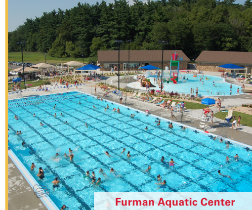
Furman Aquatic Center

A city that regularly draws performers like Jack Harlow, Chris Stapleton, and Matt Rife, along with international symphonies and Broadway musicals. A city with hundreds of acres of parks, numerous bike paths, and cultural festivals and celebrations. A city that's ranked the 2nd best college town in the nation by Livability.