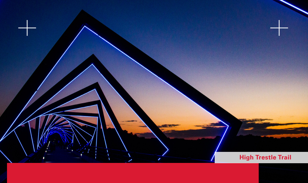
High Trestle Trail

THERE'S SO MUCH TO OFFER. YOU DON'T HAVE TO GO FAR.