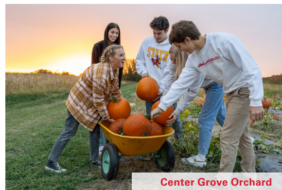
Center Grove Orchard